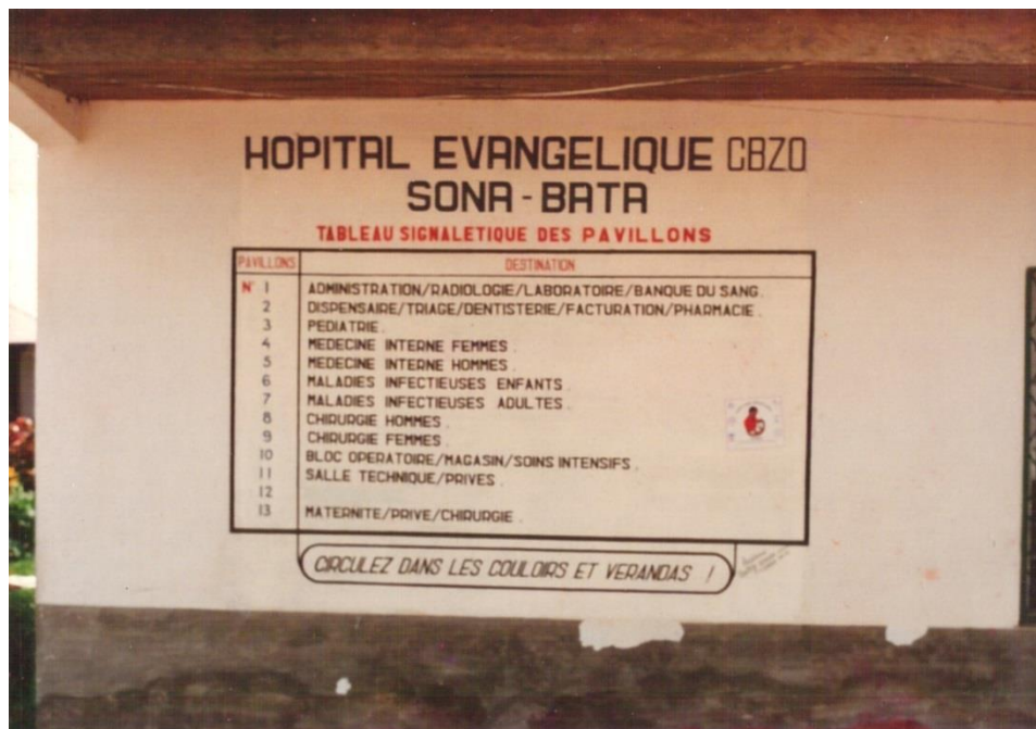
The Hospital of Sona Bata showing the plan of the buildings.