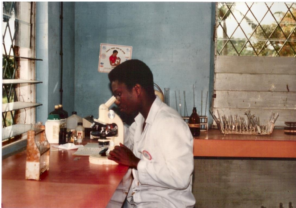
The SANRU project also provided basic equipment for the health centers and laboratory such as the microscope and reagents shown above.