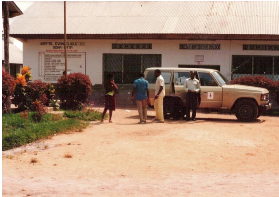
The SANRU HQ vehicle making a visit to the Health Zone of Sona Bata (1983). Sona Bata is located in Bas Congo on just outside of Kinshasa. It was the closest SANRU-assisted health zone to Kinshasa, and, as a result, the most visited during the project.