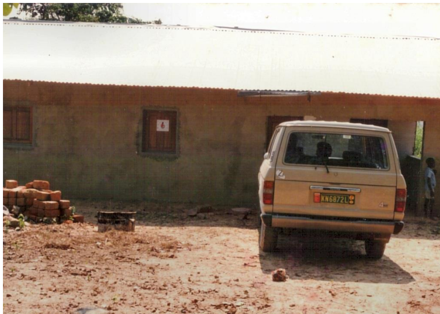
Visiting a health centers of Sona Bata Health zone where project funded rehabilitation activities were taking place.