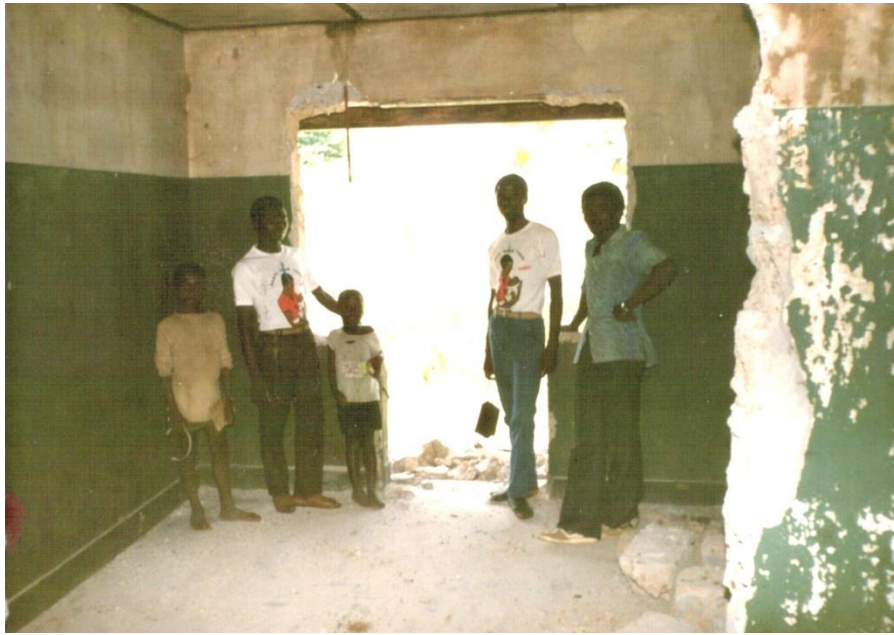
Photos (above and below) showing some of the rehabilitation needs. Many dispensaries had been constructed in the 1950s and, thirty years later, were in need of some serious rehabilitation during the SANRU project.