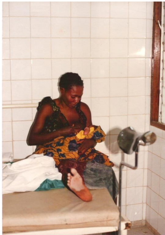
mother breast-feeding her newborn in the maternity.